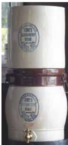
5 gal Douglas King Ginger Beer, Winnipeg adv. cooler (restored), $2000. 5 gal King adv. jug sitting upside down atop cooler (spout chips), $200.