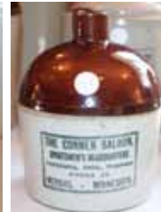
1 qt. Vergas, MN adv. jug, $1200.