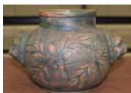
Right: A $175 bid won these Jolly Jars (chips).