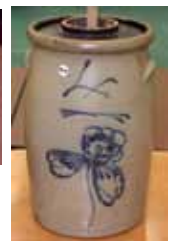
The crowd didn't believe Red Wing made this butterfly churn; thus it sold for $650.