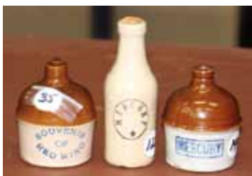
From left to right, these Red Wing miniatures crossed the block at $300, $250 (chip) and $175, respectively.

Of all the items made by Maple City Pottery that were sold to benefit the RWCS, this awesome churn garnered the most attention. The fine "Big Buttermilk Biscuits" advertising artwork on the front was reflected by an impressive $650 bid.