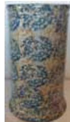
Sponge umbrella stand, $2600.