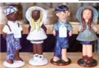
Front & back views of standard boy/girl statues (left) and lunch-hour versions (right).