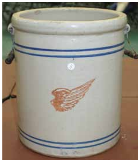
Above: Drawing a surprising final bid of $4200, this 8 gallon blue-banded crock with 6-inch wing and bail handles was the top lot of this year's RWCS Convention Auction.