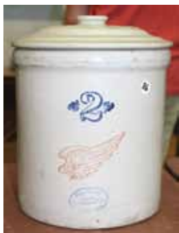
Used on Ft. Dodge stoneware, the "2" floral stamp makes this Red Wing crock possibly one-of-a-kind. Despite a hairline on the bottom front, many considered it to be one of the best buys of the auction at $625.