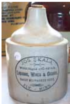
½ gal. Jos. Skala, Ely, MN adv. jug, $1050.