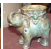
At 6 3/4" tall, this Nokomis Elephant brought $450.