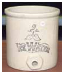
$2100 was the final bid on this great 2 gal Elephant Ear Ice Water (hairline on back).