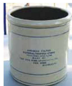
The two items directly above are zinc glaze transition pieces.