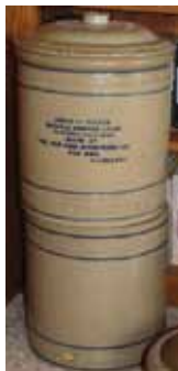
4 gal. Red Wing salt glaze Success Filter, $2000.

The Houghton Auction Service sold the collection of RWCS Member Pat Stambaugh in Hager City, Wis. on July 10. Those who attended were treated to one of the best auctions of advertising stoneware since the Wayne & Sue Chapman Collection was sold in 2006. About 380 items crossed the block and they appealed to a wide range of interests and price ranges, selling from $1 up to $3400. Below are all the pieces that topped $1000 at the sale.