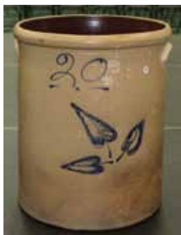
This 20 gallon salt glaze crock sold for $500. It had severe glaze pitting throughout, but the unique decoration of three upturned cobalt leaves made it an interesting piece.