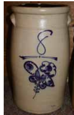
Although the churn above likely isn't Red Wing, it's possible that the decorator worked there at some point.