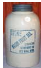
½ gal. dome-top Union Stoneware Mason jar, $3400.