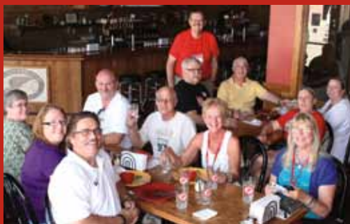
Above: A group of Red Wingers enjoyed pizza and calzones at the new Red Wing Brewery located on Old West Main Street.