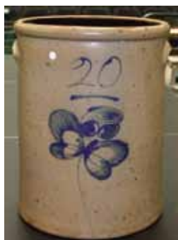
Back-stamped "Red Wing Stoneware Co.," this 20 gal butterfly crock had no damage. But, the unusual brown impurities in the clay might be to blame for it selling for only $1050.