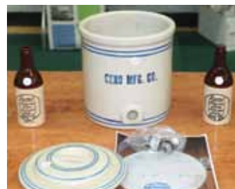
Ink-stamped with the RWUSCo oval on the bottom, this 2 gal cooler w/adv. on both sides sold for $2100. It came with a lid and two stoneware bottles with adv. from the same Geno Brewing Co.