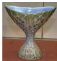
These M-3014 Charles Murphy Decorator Line pieces sold for $200 and $325, respectively.