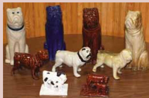
Above: Row 1 (left to right): The 2013 Cow & Calf Special Commemoratives; Row 2: Versions A, B & C of the 2013 Red Wing Bulldog Commemorative. Row 3: The large sitting Bulldogs made and auctioned off to benefit the RWCS.

P.S. We will also auction off one last set of large sitting Bulldogs at MidWinter (below).