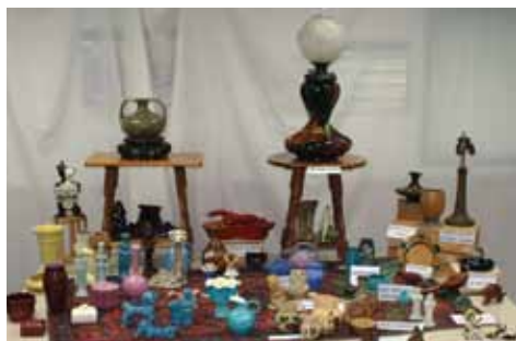
Best of Show: "American Art Pottery is Great, but we Love our Red Wing" by Gretchen Voight.

Other Art Pottery Display: "McCoy and Red Wing Flower Pots" by Ruth Beall.