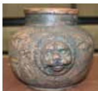
A bidding war pushed this hard-to-find Cleveland Brushed Ware vase to $1200.