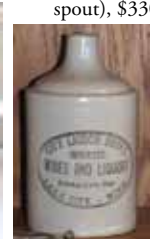
1 qt. Lake City, MN adv. jug, $1750.