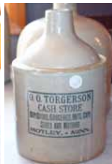
½ gal. O.O. Torgerson Motley, MN adv. jug, $2400.