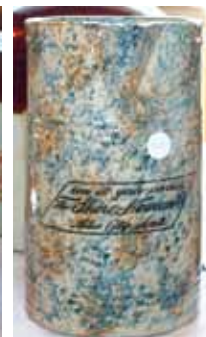
Miles City, MT sponge adv. pitcher (restored base), $2200.