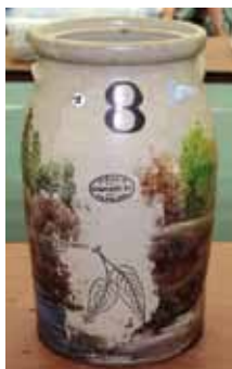
This 8 gallon oval-over birchleaf churn brought $500. It came with a chip, a crack and an elaborate covered bridge scene painted on the back (above glaze).